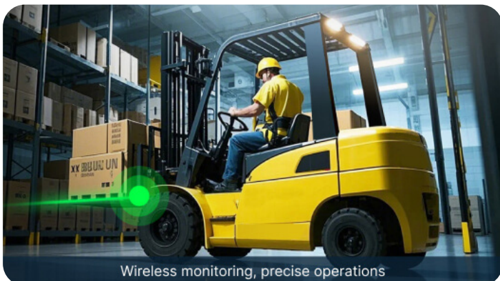
Wireless monitoring, precise operations